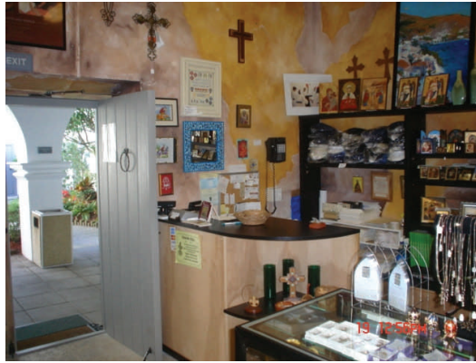
St. Photios National Shrine Museum Store