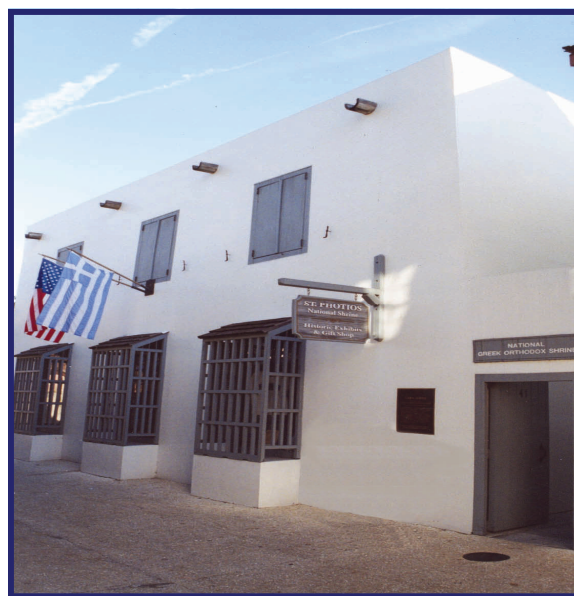
The St. Photios National Shrine in St. Augustine, Florida